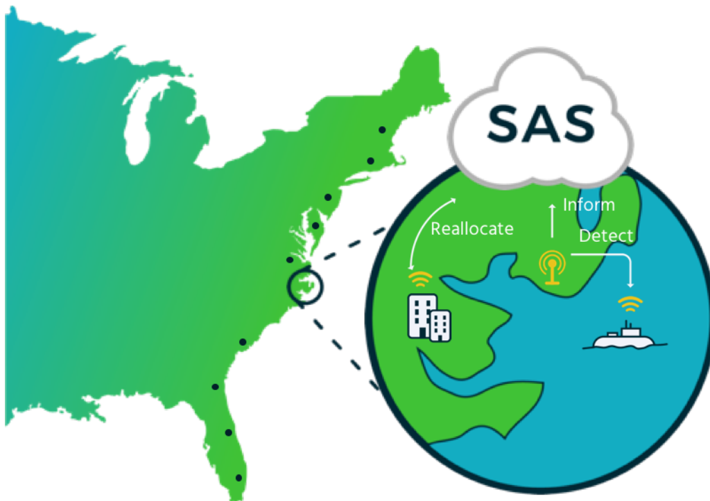
Figure 3. Environmental Sensing Capability (ESC) Forms Protection Zones

A critical element of spectrum sharing architecture is the Environmental Sensing Capability (ESC). When an ESC sensor detects a federal transmission, it activates a protection zone and informs the SAS to dynamically reallocate users in the area to other parts of the band. The ESC is a key component of the system since it opens the value of shared spectrum along U.S. coastal counties where over 50 percent of the population lives according to NOAA . By using many sensors in a network, the ESC can assure high availability of wireless spectrum.